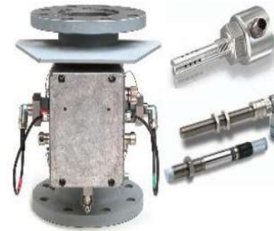
Indicators, Sensors & Systems